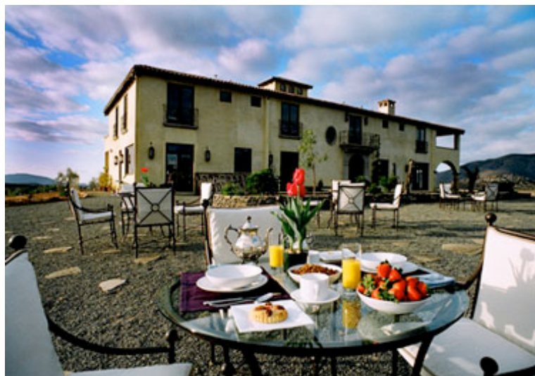
LA VILLA DEL VALLE

Baja's spectacular beaches practically scream for cerveza but, as I rode along the sinuous road that hugs the cliffs south of Tijuana, I was looking forward to the wine I'd enjoy upon my arrival. I'd recently heard about La Villa del Valle, a new inn owned by a Hollywood